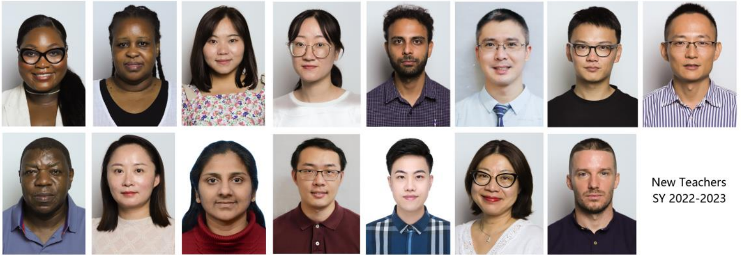
New Teachers SY 2022-2023